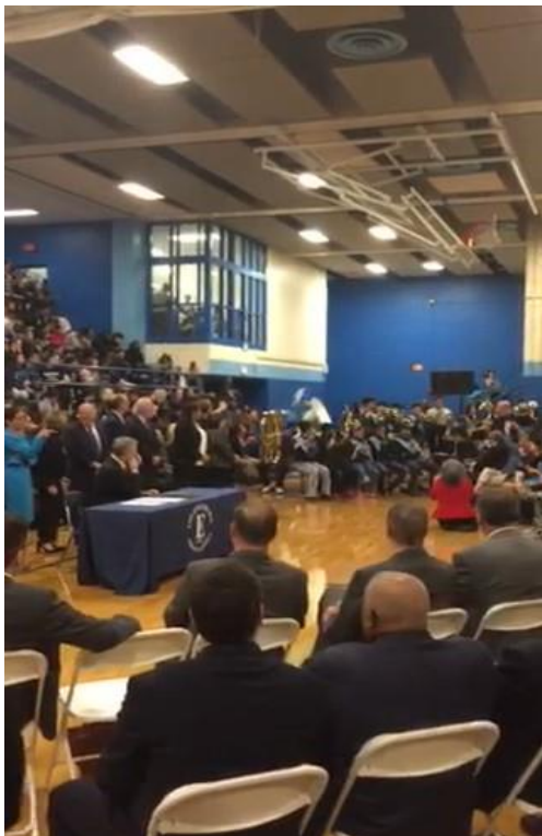
English High School Marching Band (only Marching Band in Boston)